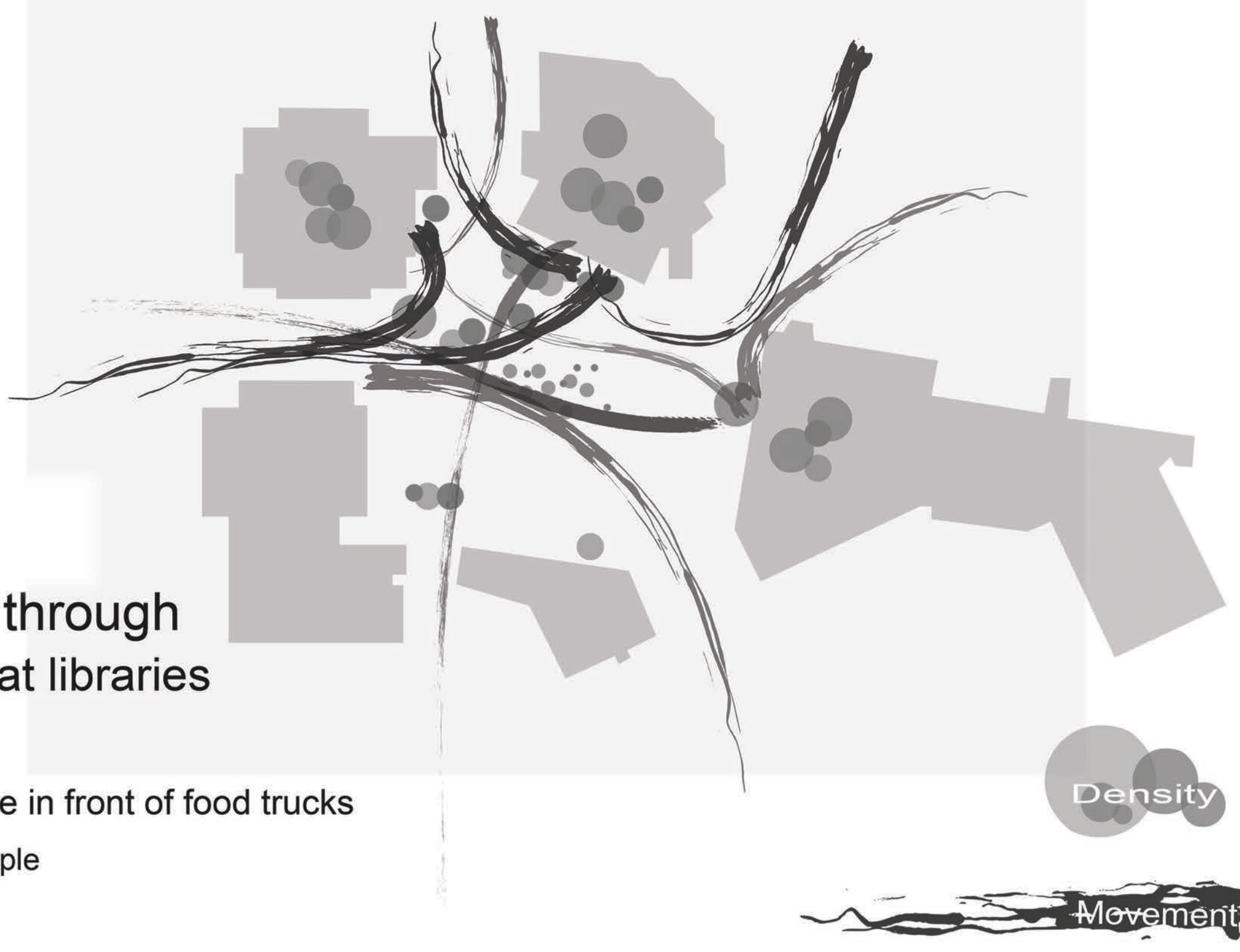
Activities at UW RED SQUARE